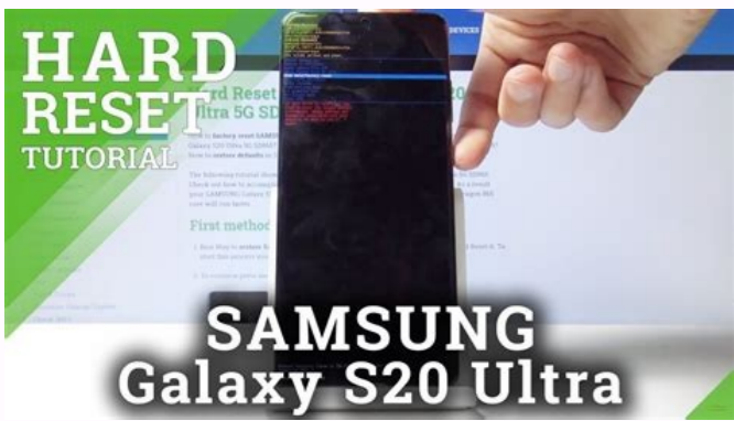
Samsung m5 reset. Reset samsung m7 speaker. How to reset samsung factory reset. Samsung smart reset. Samsung galaxy s plus i9001 hard reset. Samsung gt-i9001 hard reset password.